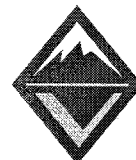
VENTURING · BSA