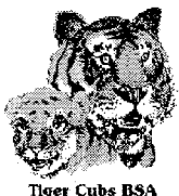
Tiger Cubs BSA